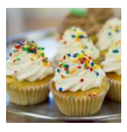
The great CPSL Mind Bake Off!

Take your book club online or set up your own online book club. Donate the money that your group would have spent in the café to CPSL Mind.