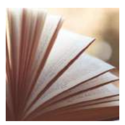
Virtual book clubs

If you have a talent such as singing or comedy, now is your time to share it! Take it online to a virtual gig or onto platforms such as YouTube or Instagram Live.