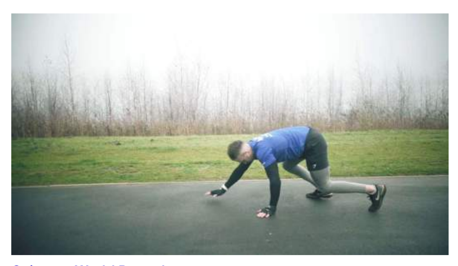
Guinness World Record- Could you be the next world record holder? Please go to the Guinness World Records website to learn how to complete a challenge safely (<a href="www.guinnessworldrecords.com">www.guinnessworldrecords.com</a>).